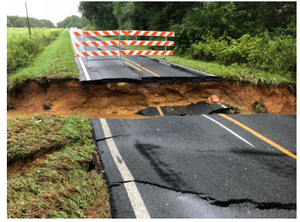
These are some pictures near Thompson Creek. This just shows some of the damage caused by Florence.