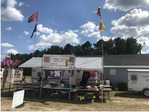
The Col. E. T. Stackhouse Camp of Latta set up a recruiting and sales tent at the Southern 500 in Darlington for 4 days over Labor Day Weekend.