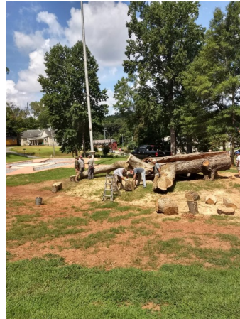
At time of departure