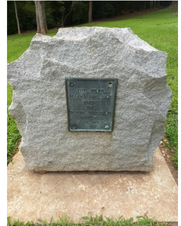
Plaque showing this is the site of the first secession speeches.

Signers Monument tree cleanup Saturday, August 11th.