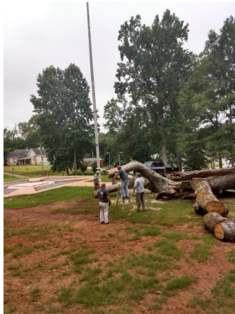
Early morning, with monument base seen in photo