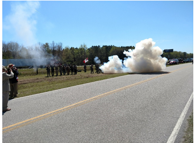
The Artillery salute when the flag was raised.