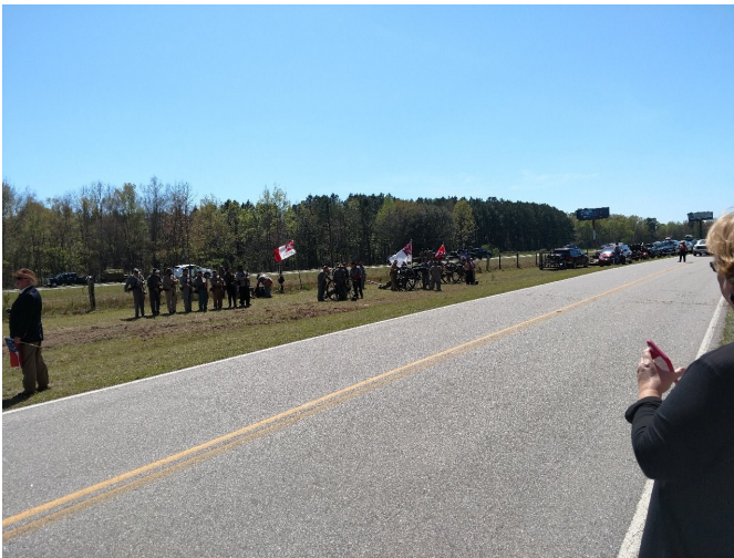
Santee Light Artillery with the Georgia Black Creek Artillery