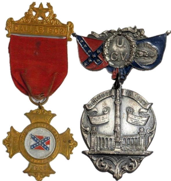
Original UCV Medals

This year's Reunion Medal is inspired by turn of the century United Confederate Veteran Reunion Medals from Richmond, VA and Dallas, TX. Additional medals can be purchased for $20 each on a first-come basis. Don't miss your chance to own a piece of SCV history!