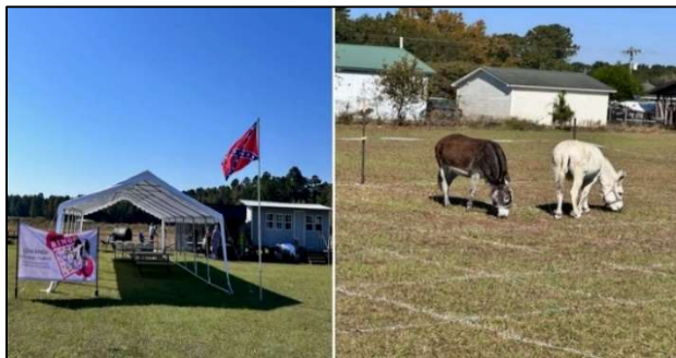
From Litchfield Independent Newsletter, Nov. 2024

Litchfield Camp 132 in Conway, SC held its annual Camp Cow Bingo on Oct. 26, 2024 but with a TWIST because the cow that was to be used had died. So, they had to use a mule instead and got some good results!