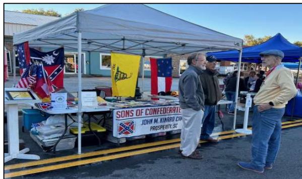
From Palmetto Defender Newsletter, Oct-Nov. 2024

John M. Kinard Camp 36 in Prosperity, SC set up a recruitment and sales booth at the Newberry Oktoberfest on October 19, 2024.