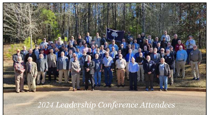
2024 Leadership Conference Attendees