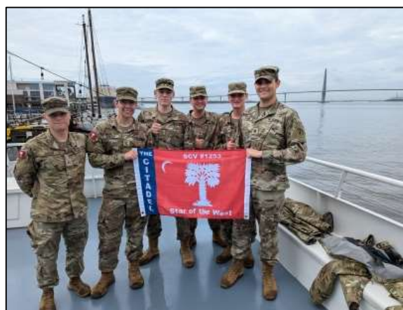
Cadet prospective members of Star of the West Camp 1253 pose with the Camp Flag.

On Nov. 7, 2024, members of Fort Sumter Camp 1269 cruised with The Stray Dog Society, alumni of The Citadel. Annually on their Homecoming weekend, the Society coordinates Citadel Cadets to raise a BIG RED flag over Castle Pinckney, Fort Sumter Camp's historical site in Charleston Harbor.