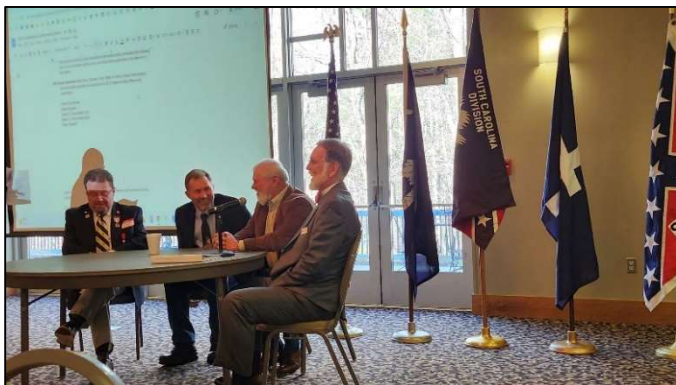
Training Session from 2024 Leadership Conference.

https://scscv.com/events/2025-sc-division-leadership-conference/