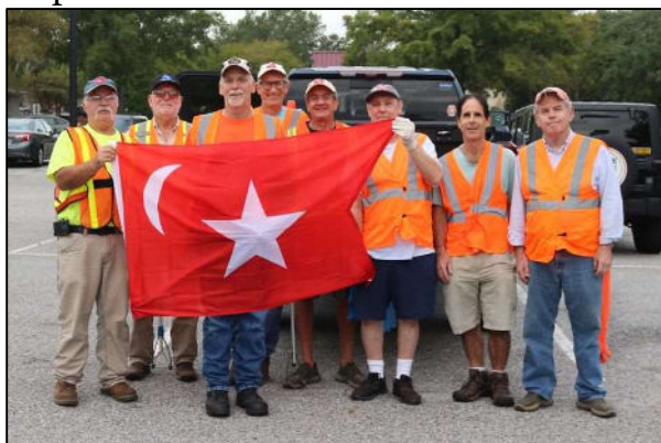
From The Sentinel Newsletter, Nov. 2024

Secession Camp 4 in Charleston, SC Camp members held a highway cleanup along Glen McConnell Blvd in Charleston on Oct. 5, 2024. Camp 4 members picked up a total of 98 bags of trash during 2024 over six highway cleanups.