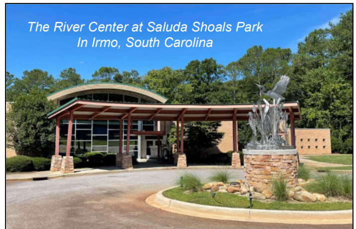
The River Center at Saluda Shoals Park In Irmo, South Carolina

This year's event will consist of detailed functions important to the core camp leadership and will allow camp commanders and the other key leaders of the camp to engage in conversations about subjects that are important in running a successful camp.